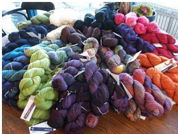
Malabrigo Sock, Arroyo, and lots of Nube merino roving