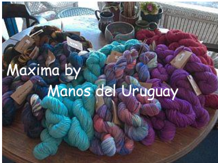
Maxima by Manos del Uruguay