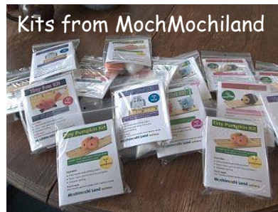
Kits from MochMochiland