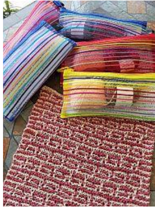
Mosaic Linen Washcloth