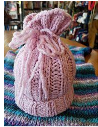
Easy Baby Hat

I'll be working on some Crochet Mini Kits this week. You'll find these kits right up front in the shop.