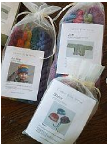
Kits from CEY