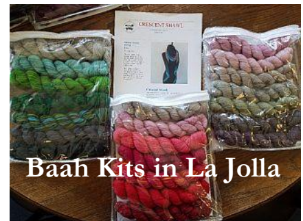
Baah Kits in La Jolla