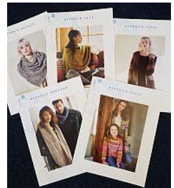
New Fall Books