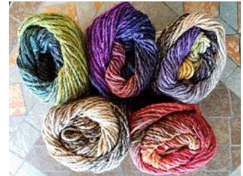
New Silk Garden