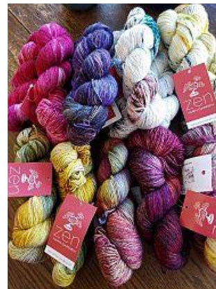
Zen Yarn Garden