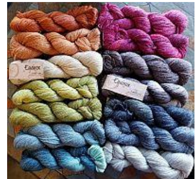
Plymouth Equinox Merino/silk/linen