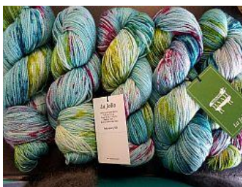
La Jolla Feb. '18