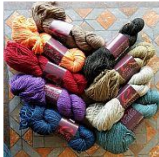
New Superwash DK By Ella Rae