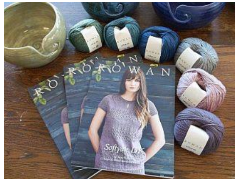
New from Rowan Soft Yak

A silky light cotton/Yak blend with beautiful designs and year-round style choices