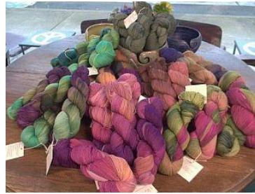
Happy Fuzzy Corrie Sock