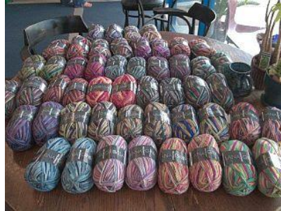
Lana Grossa sock yarns