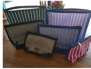
Della Q project bags & Mesh gadget cases