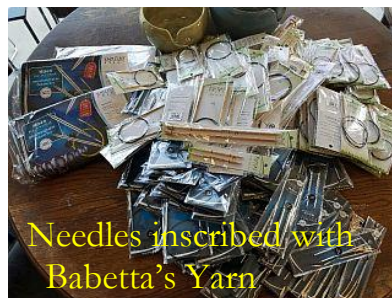
Needles inscribed with Babetta's Yarn