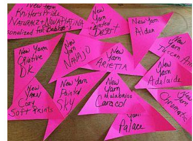
Look for pink tags to find new yarns