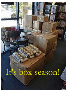
It's box season!