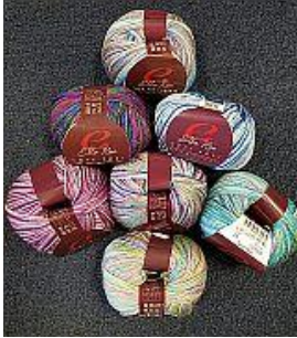
Ella Rae Cozy Soft