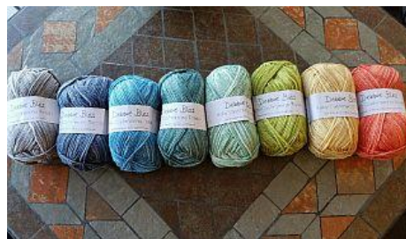
Debbie Bliss Cashmerino Tonals