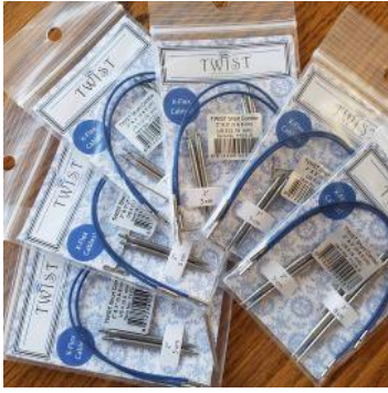
ChiaGoo Mini Twists