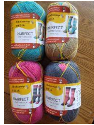
New Pairfect Colors

Many new yarns from Cascade and some new books too