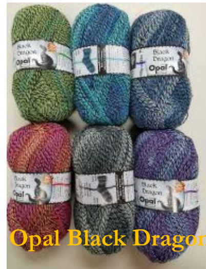
Opal Black Dragon