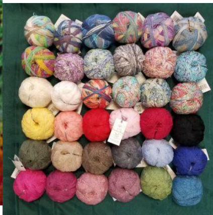
36 colors of Bamboo Pop Sock