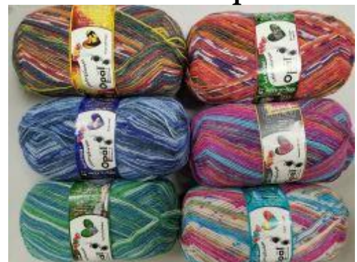
I have more Opal coming!