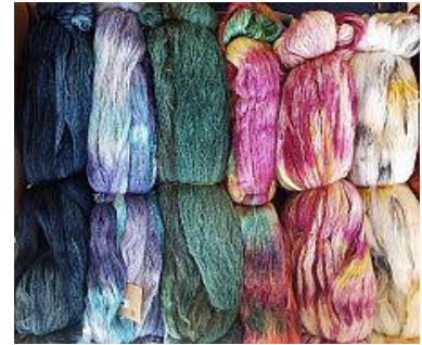
More colors of Marina by Manos del Uruguay