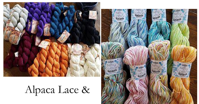
Alpaca Lace &