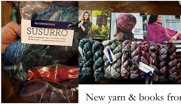
New yarn & books from Malabrigo