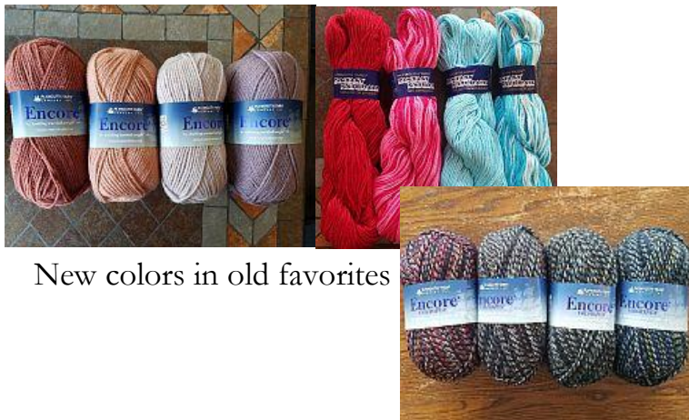
New colors in old favorites