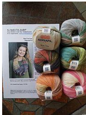
Adrifil Bon Ton