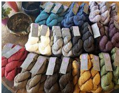
New from Plymouth Yarns Reserve Sport in solids