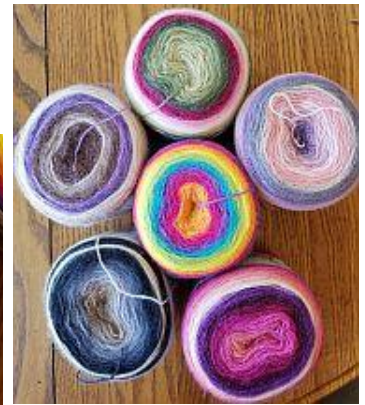
Nako Angora Links in 6 colors