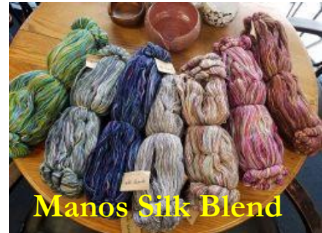
Manos Silk Blend